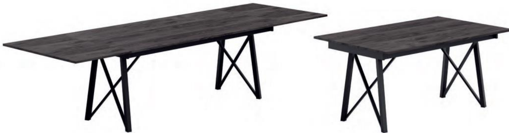
T Wacko2.0 HPL ht75 210W ep79 HP08